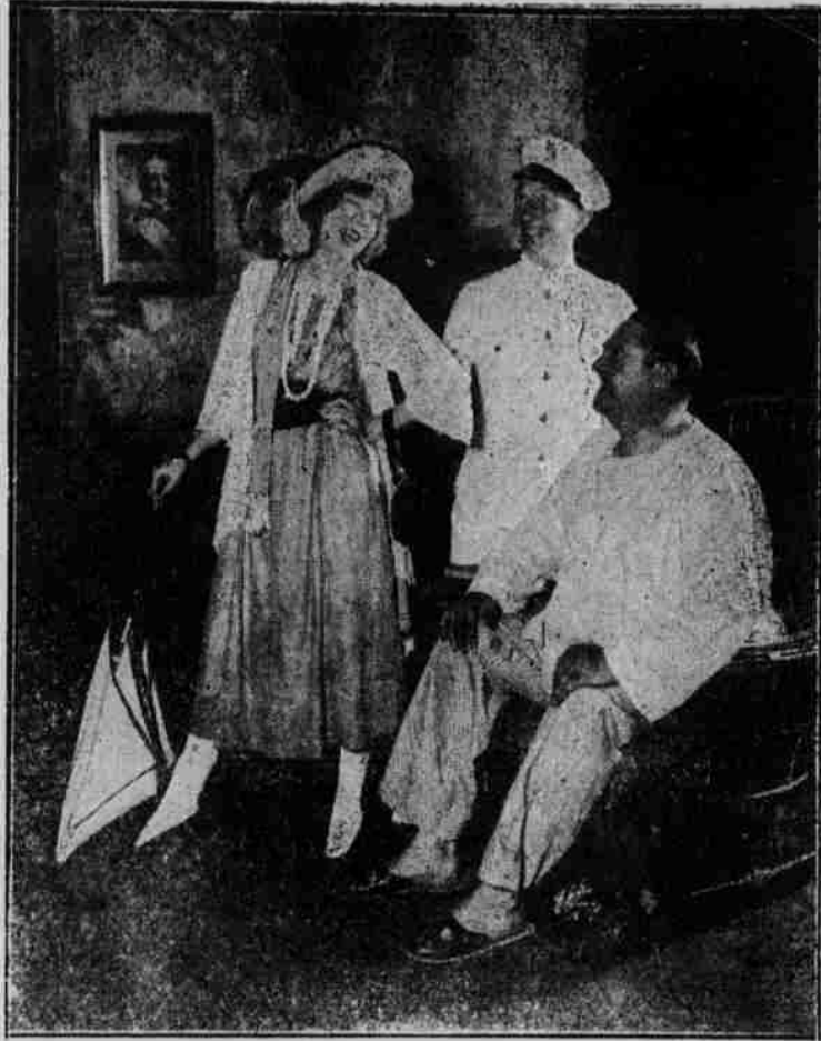
Scene from "Rain," Orpheum Theater, three days commencing Monday, February 16, Matinee, Wednesday.—Adv.

SHOWS—2:30, 7:00, 9:00. MATS.—25c; NITE—50c; GAL.—20c