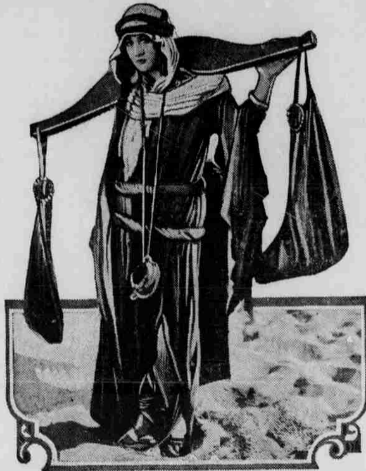
Miriam the Burden Bearer, played by Estelle Taylor in "The Ten Commandments" at the Orpheum Theater, this week only.—Adv.