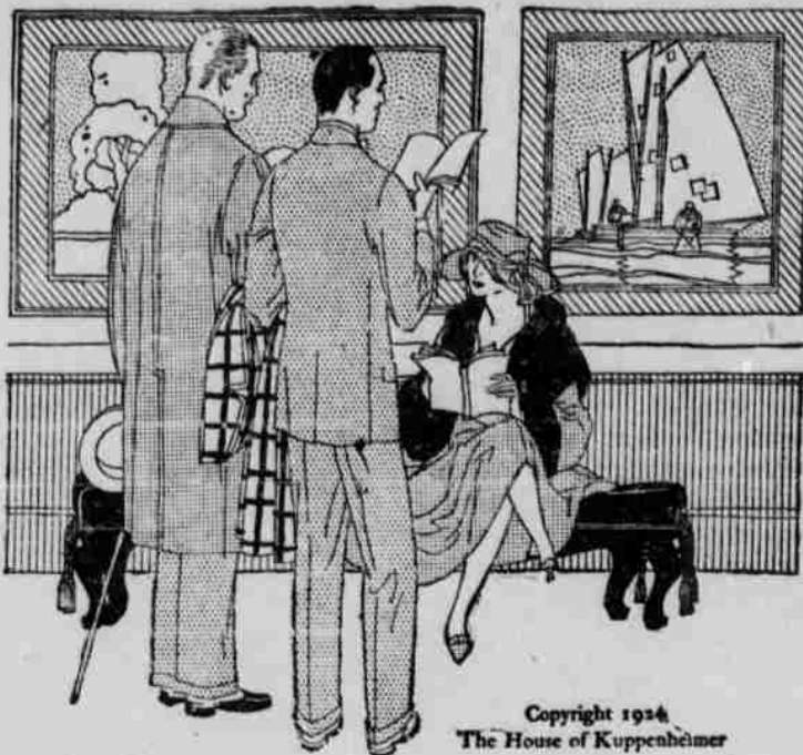
Copyright 1924 The House of Kuppenheimer