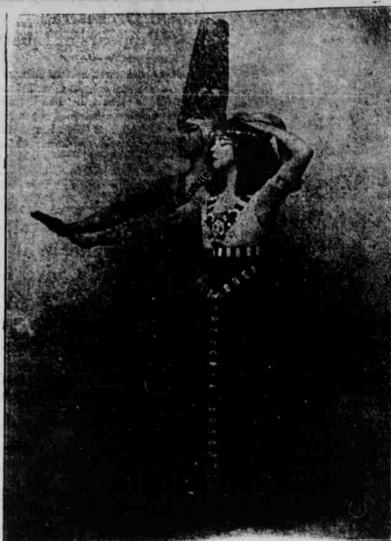
RUTH ST. DENIS AND TED SHAWN IN EGYPTIAN DUET.

Such students will follow the regular four year course in business administration, giving special attention to economic geography, soils, investments, insurance, accounting, advertising, salesmanship, business law, rural economics, mechanical drawing, architectural composition and design, and various other courses in the College of Agriculture and Engineering.