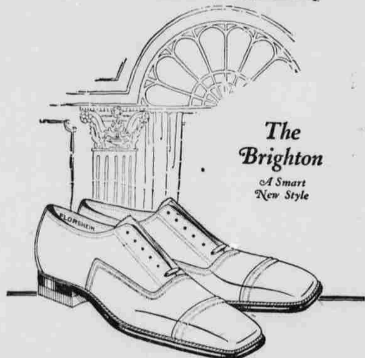
The Brighton A Smart New Style

A story of shoe satisfaction can be told in a word—if that word is "Florsheim."