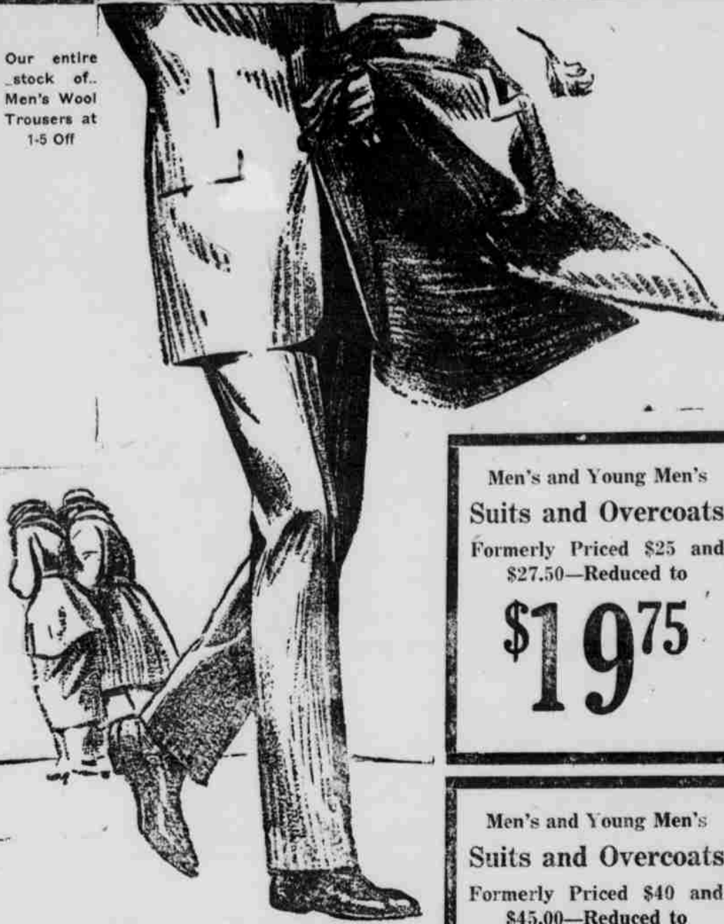
Our entire stock of Men's Wool Trousers at 1-5 Off

All the clothing in our Repricing Offering is Acknowledged High Standard of fabric and tailoring, which means the best procurable. These revised figures permit purchasers to secure clothing of the highest type at prices of the ordinary and make substantial and worthwhile savings in expenditures.