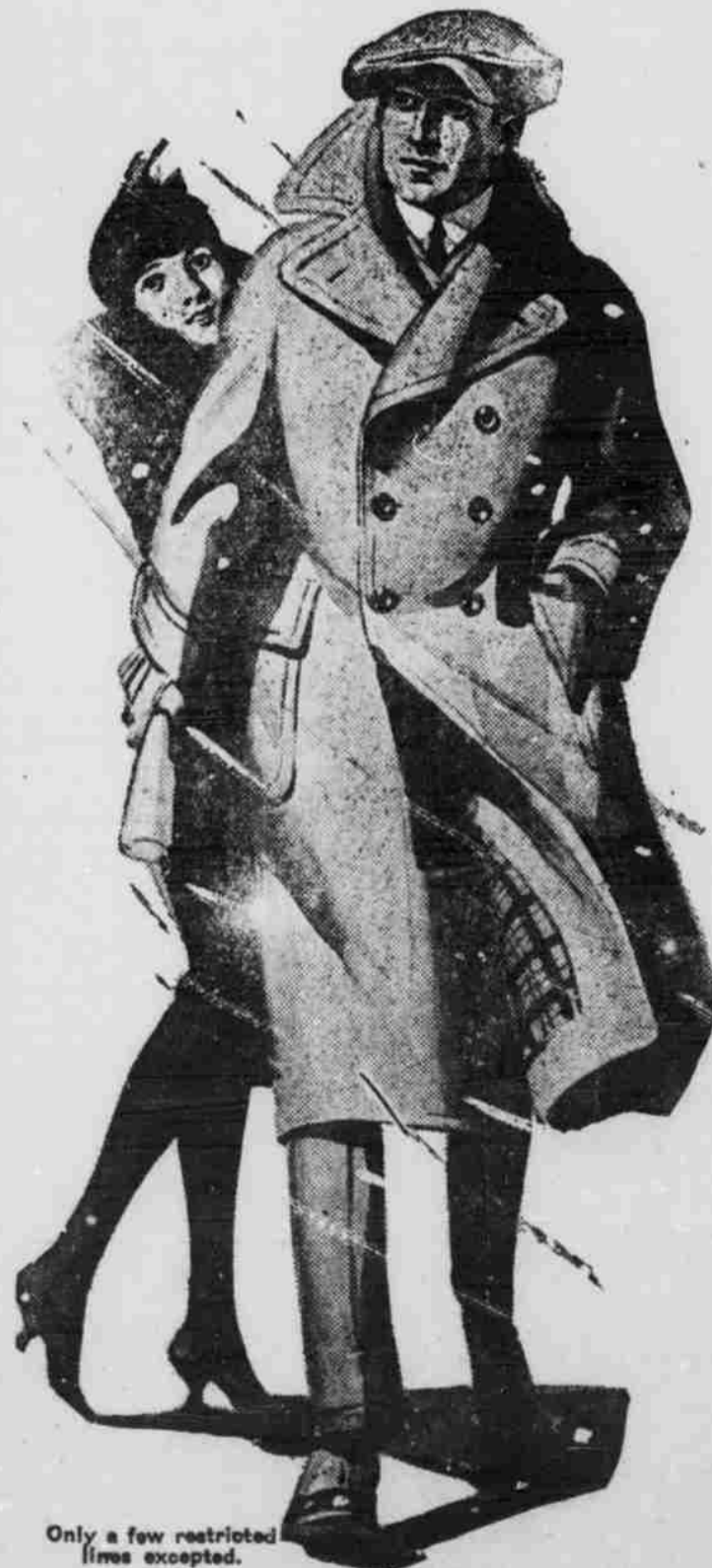
Only a few restricted lines excepted.