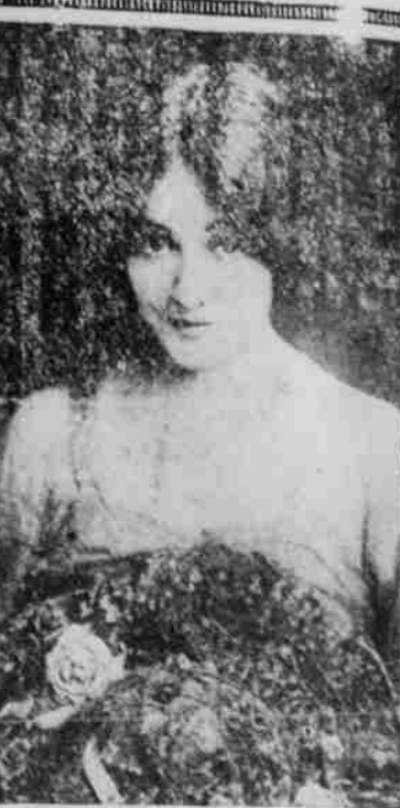
GLADYS BROCKWELL DIRECTION WILLIAM FOX Gladys Brockwell in "The Mother of His Children" at the Colonial Monday, Tuesday and Wednesday.