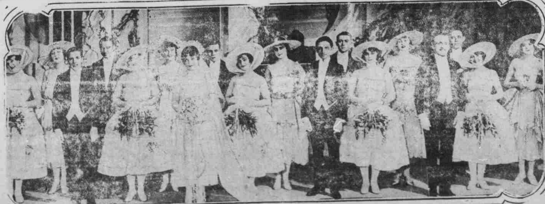
"The Four Husbands" Headliner at the Orpheum this Week

ALUMNI NOTES FRESHMAN GIRLS DEFEAT JUNIORS IN BASKETBALL The freshmen girls' baseball nine defeated the juniors in the first game of the tournament Wednesday morn- ing. The seniors will meet the sopho- mores in the second game of the pre- liminaries this morning at 11 o'clock. The winners will play the final match with the freshmen, Friday morning at 11 o'clock.