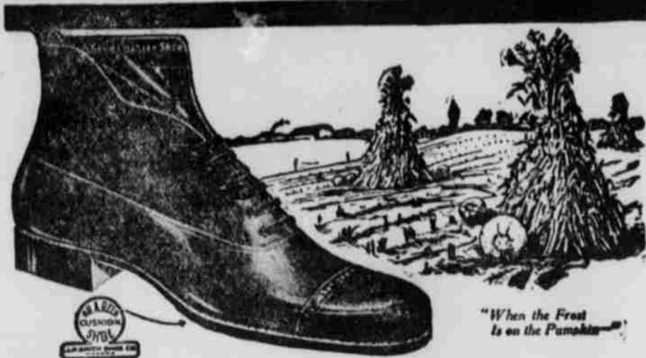
Look for this trade-mark on the sole.