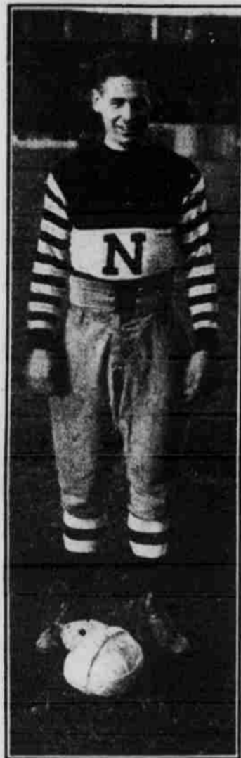
LANTZ Half—First Year Ravenna