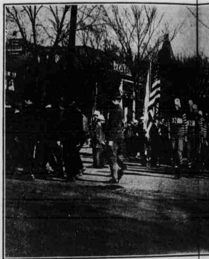
Husker Warriors Celebrate