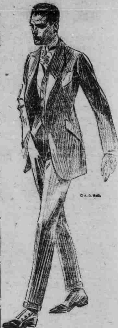
Society Brand Clothes

Men's $20 and $22.50 Suits and Overcoats now going at... $14.75