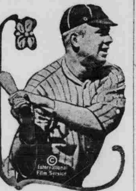
Tris Speaker. Phillies, against Cincinnati, and Demaree of the Phillies, pitching against the Pirates.

Redfern Corsets. Back Lace Front Lace are designed with infinite care for every type of figure, and naturally the best of fabrics, boning and other materials is used in their design, for they are high class corsets. But a Redfern is not an indulgence. It is a healthful safeguard. You will find it all you expect the best corset to be—comfortable, fashionable and serviceable. From Three Dollars Up For Sale by Miller & Paine INC. O and 13th Streets