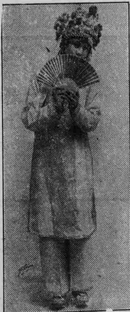
Mrs. Coburn as "Plum Blossom" MR. AND MRS. COBURN IN "THE YELLOWJACKET"