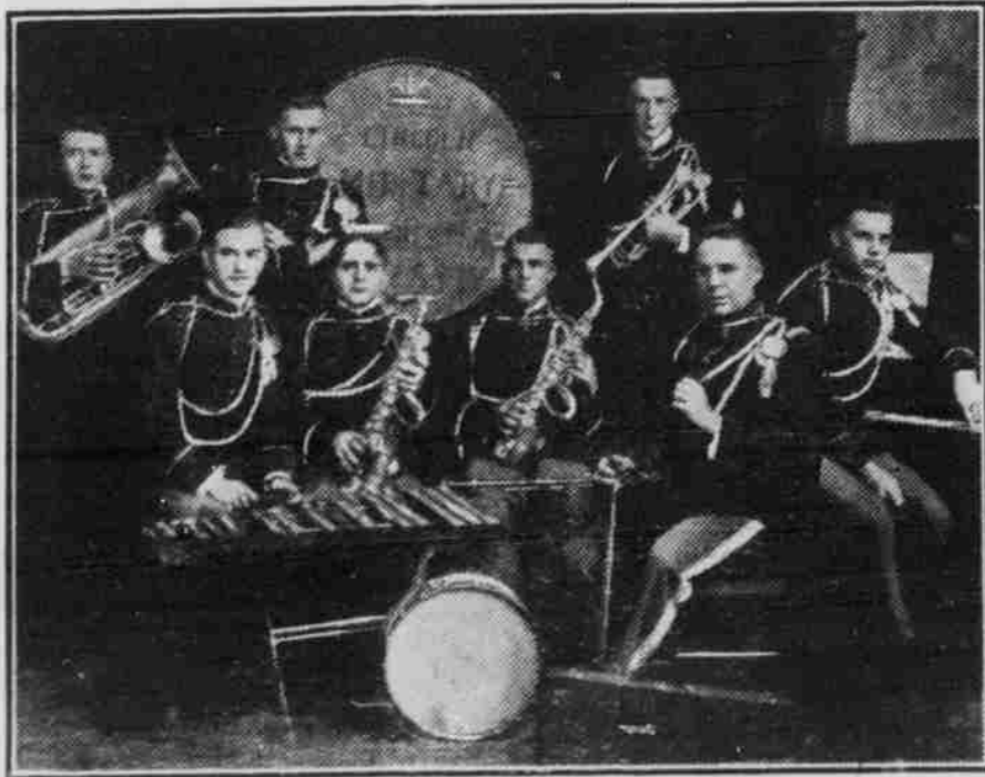
LINCOLN MILITARY ORCHESTRA