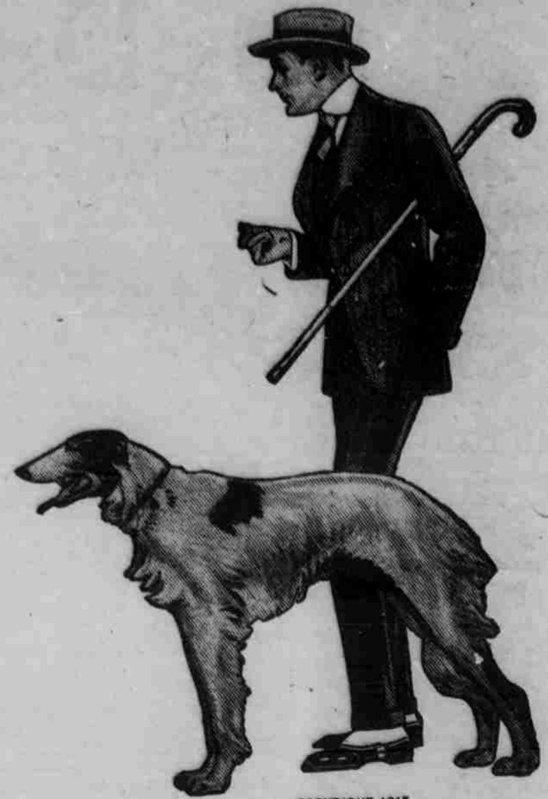
COPYRIGHT 1915 THE HOUSE OF KUPPENHEIMER