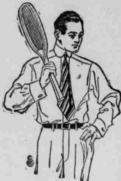
THE OLD WAY Uncomfortable

The purpose of the work is to turn out boys trained in accurate thinking and with a sense of self-reliance, whether the student quits at the eighth grade or goes on through the