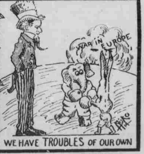
WE HAVE TROUBLES OF OUR OWN