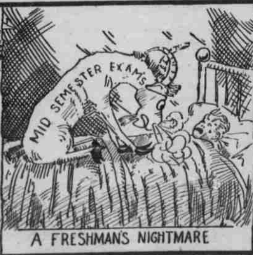
A FRESHMAN'S NIGHTMARE