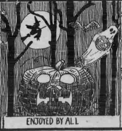
ENJOYED BY ALL