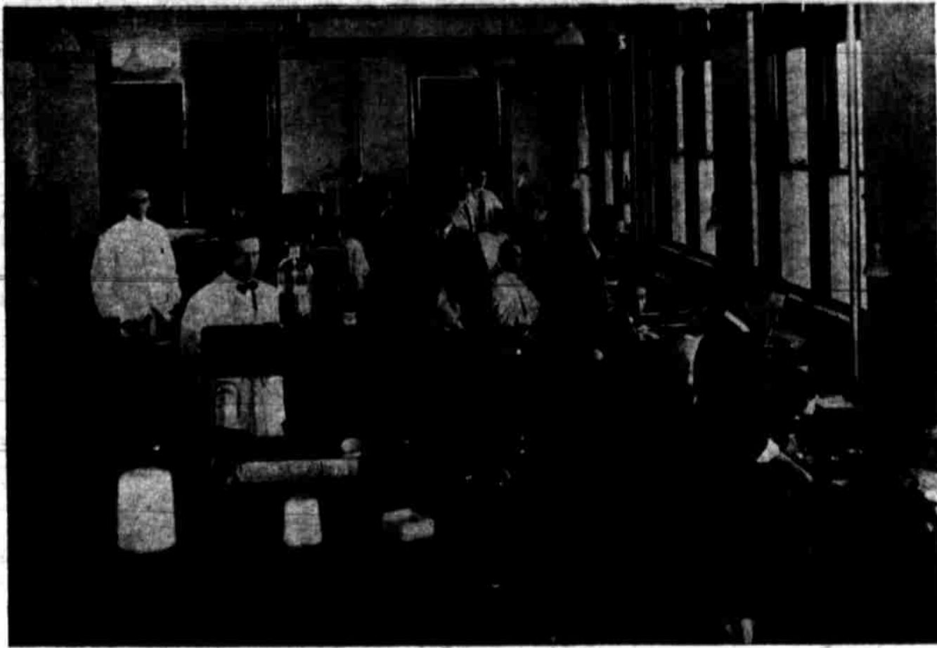
PHYSIOLOGY LABORATORY AT OMAHA