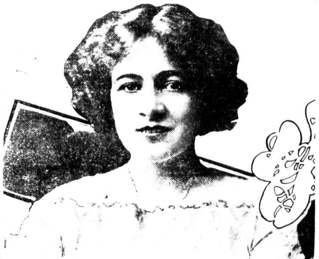
CHARMING MISS FRANCES STARR

Who comes in David Belasco production and original New York Company "The Case of Becky" at the Oliver, Saturday Matinee and Night