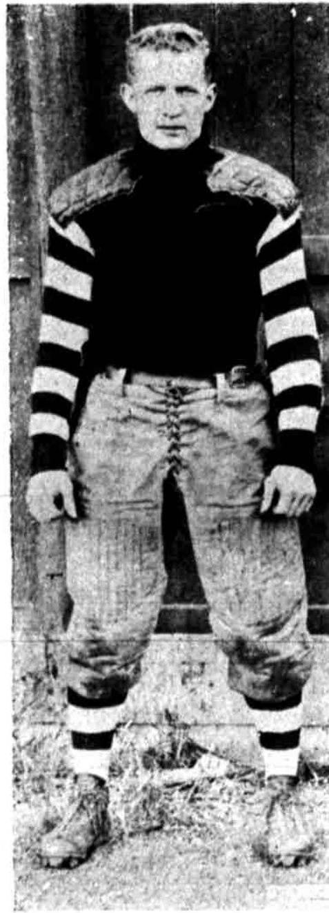
POTTER Quarter Back