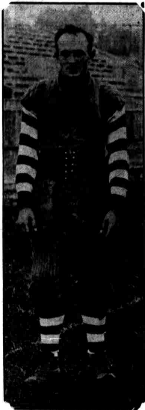
RACELY Right Half Back