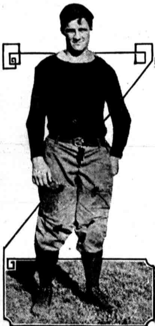
One of Yale's Best.