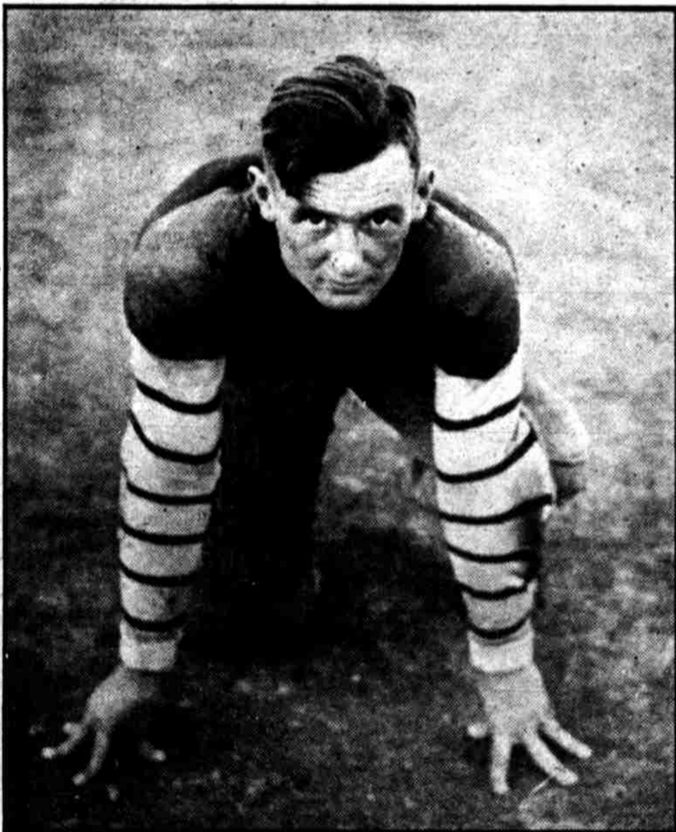
The line plunging full-back of last year who has been elected assistant football coach.