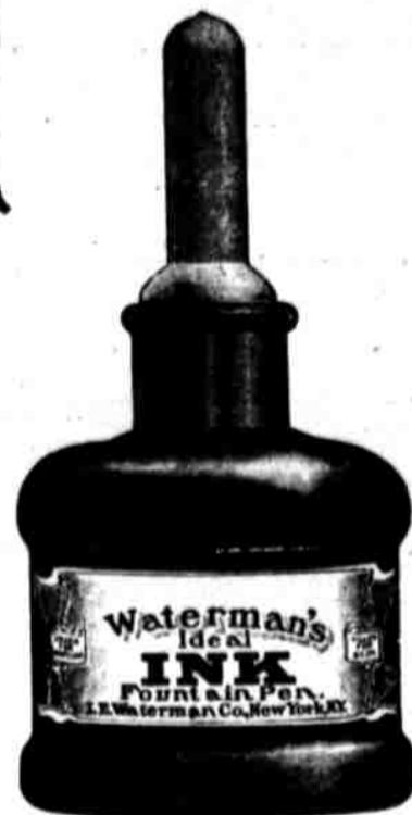
The Best Ink in the World