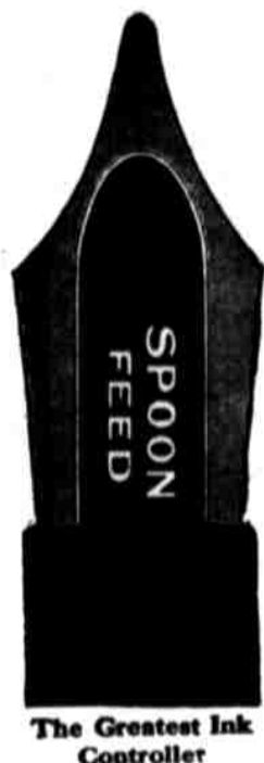
The Greatest Ink Controller