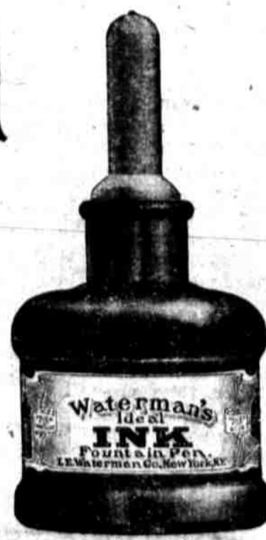
The Best Ink in the World

Special Covers for College of Engineering