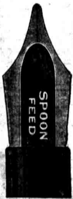
The Greatest Jet Com. roller

History Covers, 15c and 25c Kohinor Pencils