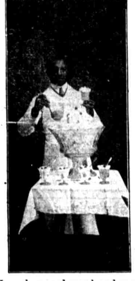
He makes good punch and serves first class light refreshments

U-All-No-Tommy Find him at Herpolsheimer's