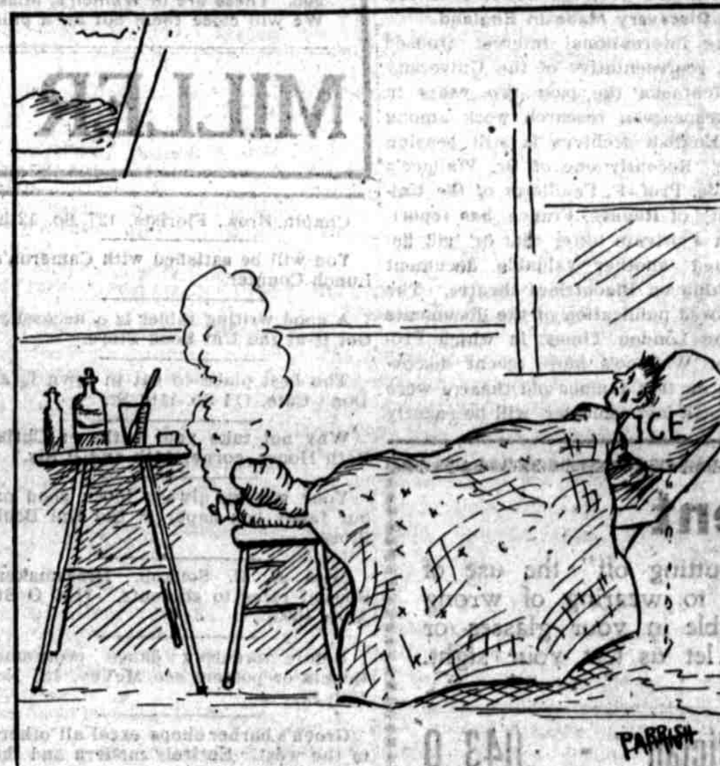
THE PACE THAT KILLS.