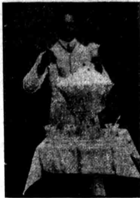
"THE UNI'S INDISPENSIBLE." We certainly know how. Lady attendant if desired.