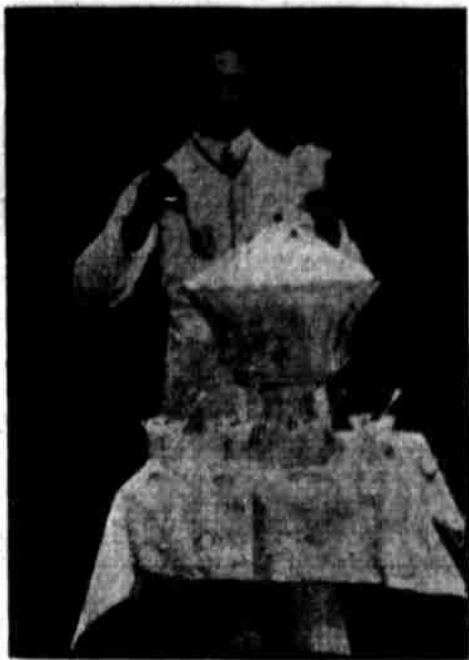
"THE UNI'S INDISPENSIBLE." We certainly know how. Lady attendant if desired.