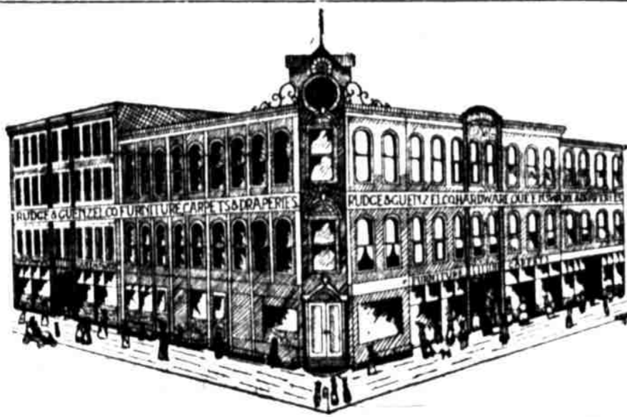
RUDGE & GUENZEL CO'S NEW STORE, 11th and O Sts