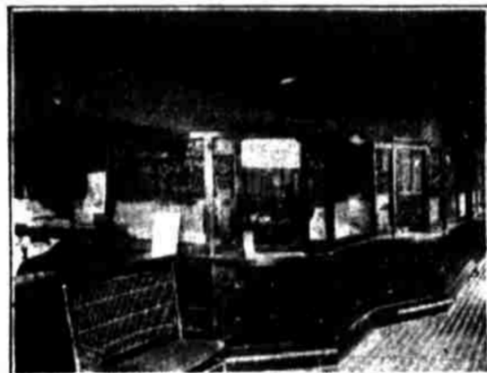
Sectional View of Actual Business and Banking Department.

BOYD BUILDING, 17th AND HARNEY STS., OMAHA, NEBR.