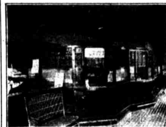
Sectional View of Actual Business and Banking Department.

BOYD BUILDING, 17th AND HARNEY STS., OMAHA, NEBR