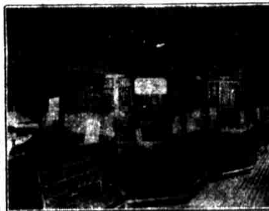
Sectional View of Actual Business and Banking Department.

BOYD BUILDING, 17th AND HARNEY STS., OMAHA, NEBR