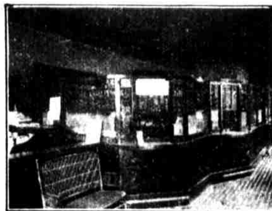
Sectional view of actual Business and Banking Department.

BOYD BUILDING, 17TH AND HARNEY STREETS, OMAHA, NEBRASKA.