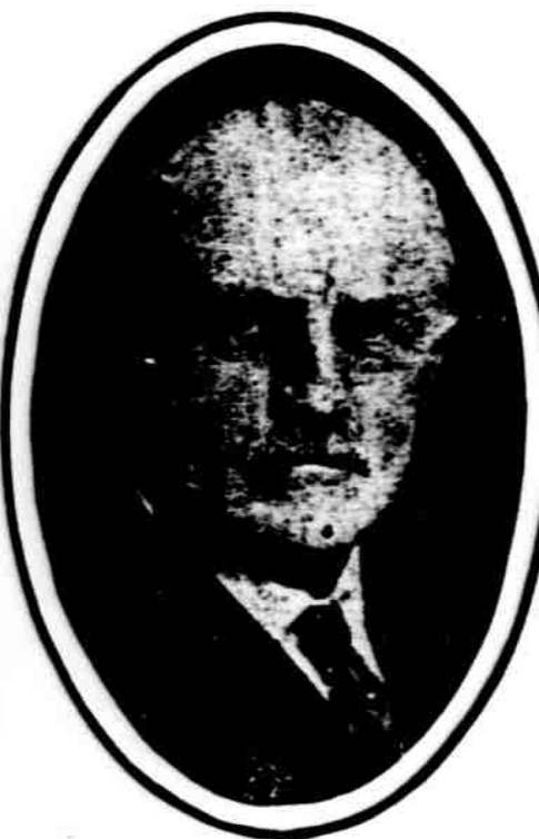
JUDGE CHARLES B. LETTON