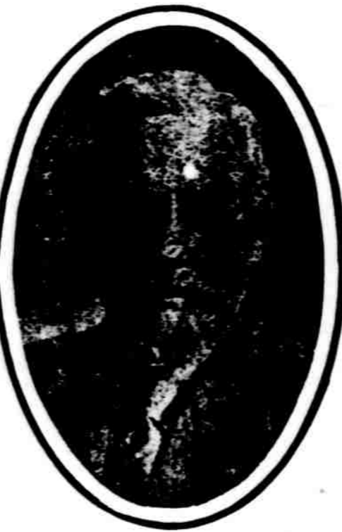
JUDGE FRANCIS G. HAMER

VOTE WITH THE PARTY OF PRINCIPLE AND PROGRESS