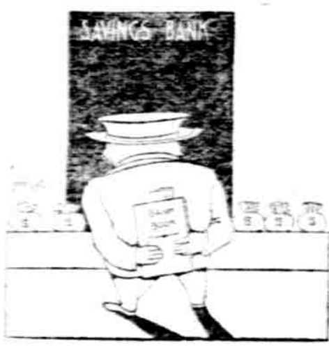
A LITTLE MAN