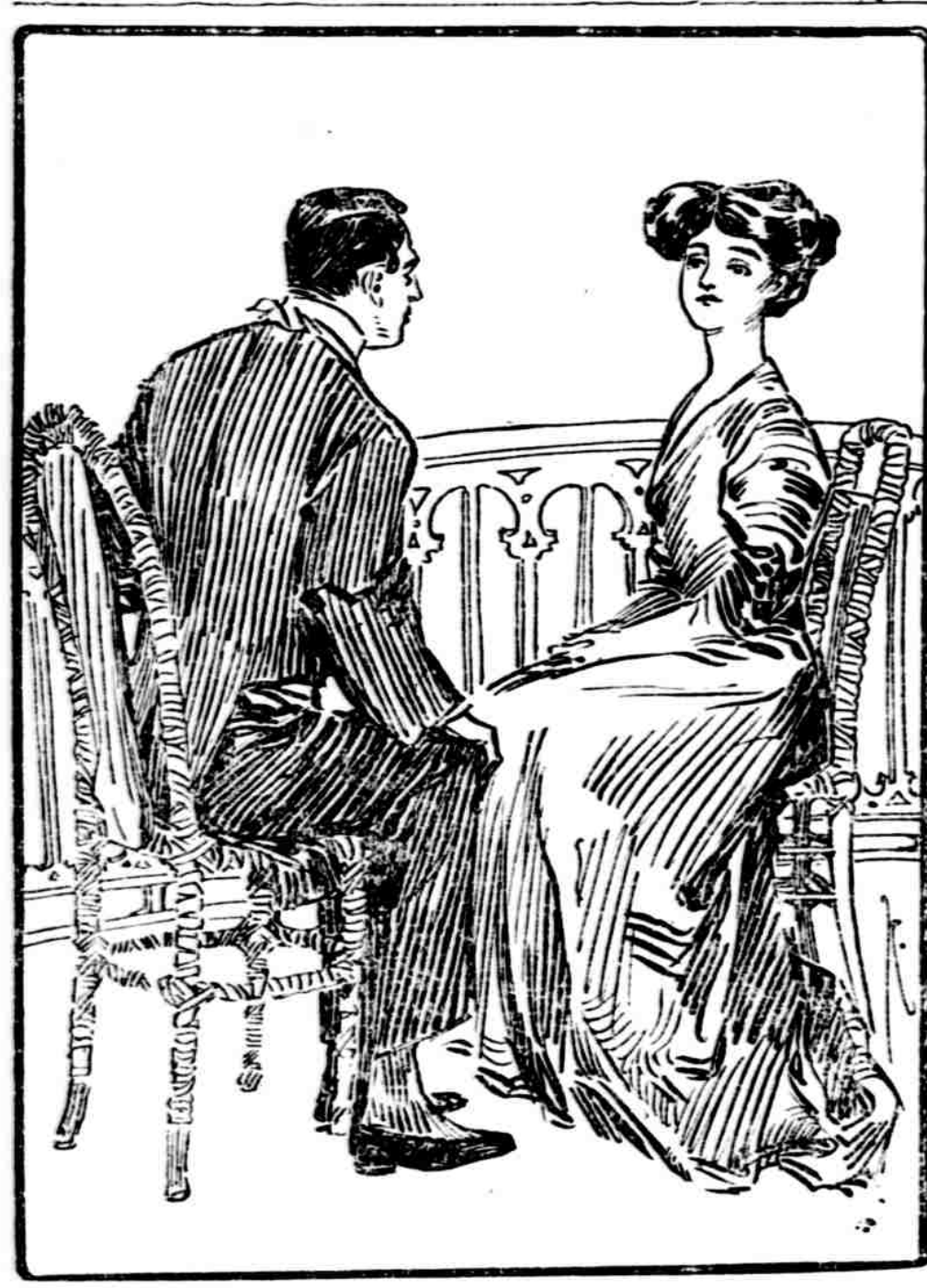
"I Have Not Forgotten-Anything."