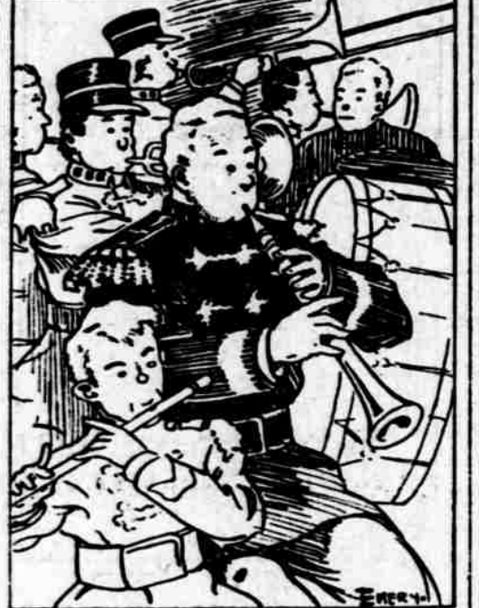
"Practicing in a Room Back of

co into Chile. If the railway had been built, the western or Pacific terminus would have been placed about ten degrees north of Valparaiso.