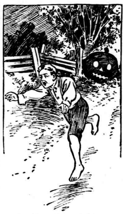
Ran Home Terror-Stricken.

Another thing that helps suppress the strength of the labor vote as to a free expression is the bread-and-butter question, the "full-dinner pail" argument. Can you blame men for giving in to this cry? I don't! Suppose the head of a factory or plant says he will have to "shut down" if a certain man isn't elected. The employe may reason to himself: "It doesn't