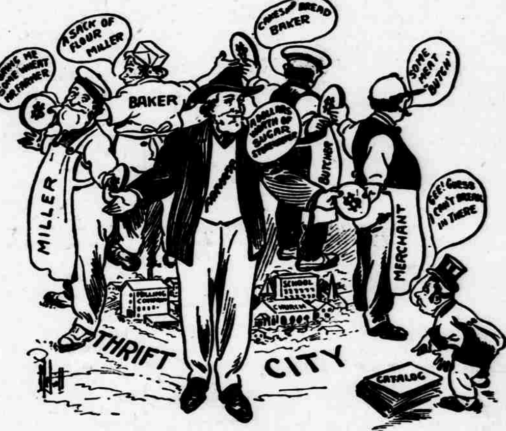
The Endless Chain-It Keeps the Dollar at Home Where It Belongs.

a check is administered the passage farmer's dollar, earned by honest toll, of the parcels post bill will mark one should not be added to the blood of its greatest triumphs.