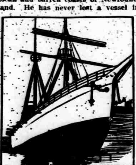
THE EXPLORATION STEAMER ARC-

Brothers college in that city and has led a stirring adventurous life on the ocean ever since, having commanded over 60 ships and steamers in all parts the navigation of the coasts of Greenland, Labrador, Hudson Bay and the bleak and barren coasts of Newfound- years, but we shall be provisioned and land. He has never lost a vessel in outfitted for six years, so that there