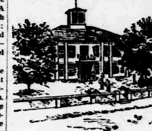
OLD CREEK COUNCIL HOUSE AT OKMULGEE, I. T.

Whether it was my liver, my lungs, or what, when my doctor doctors don't seem to know as much about it as I do. The plane facts is that it broke and busted me from heel to whiskers, and I got busted at Antium before my