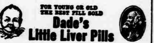
Dade's Little Liver Pills

The Salvation army continues to draw large crowds at the Methodist church. They will remain the rest of this week.