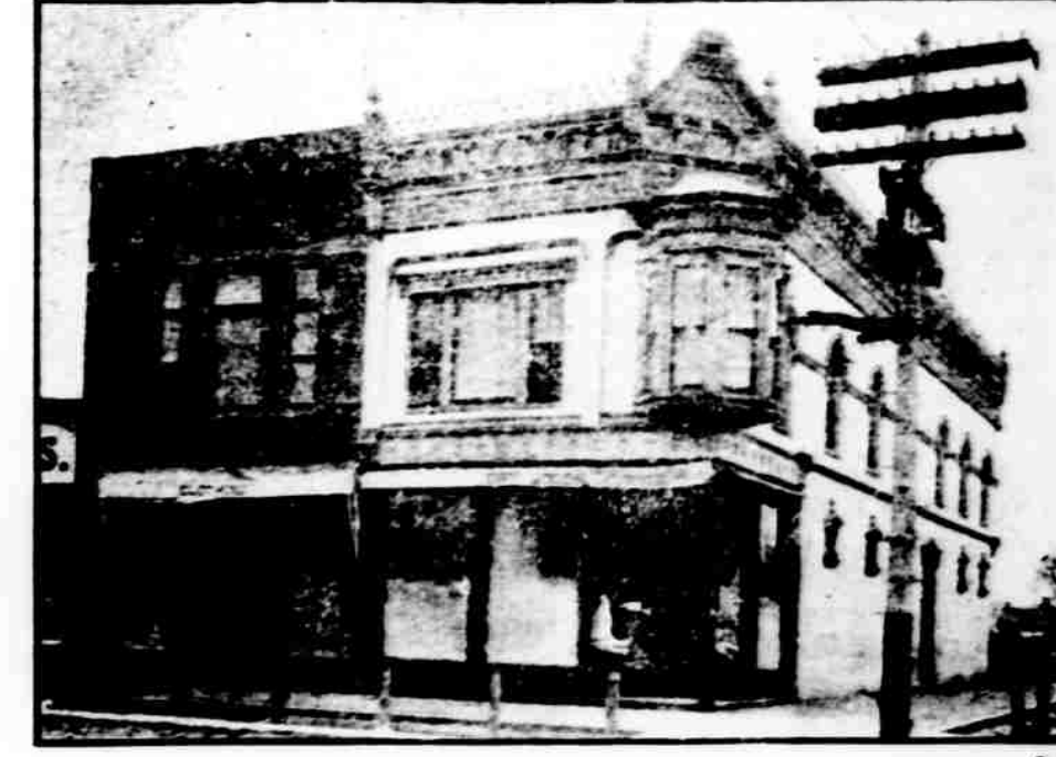
Friedhof & Co., Dry Goods and Clothing-value $15,000.