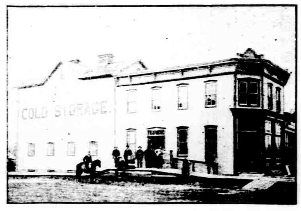
Paul Hagel's Cold Storage Plant.