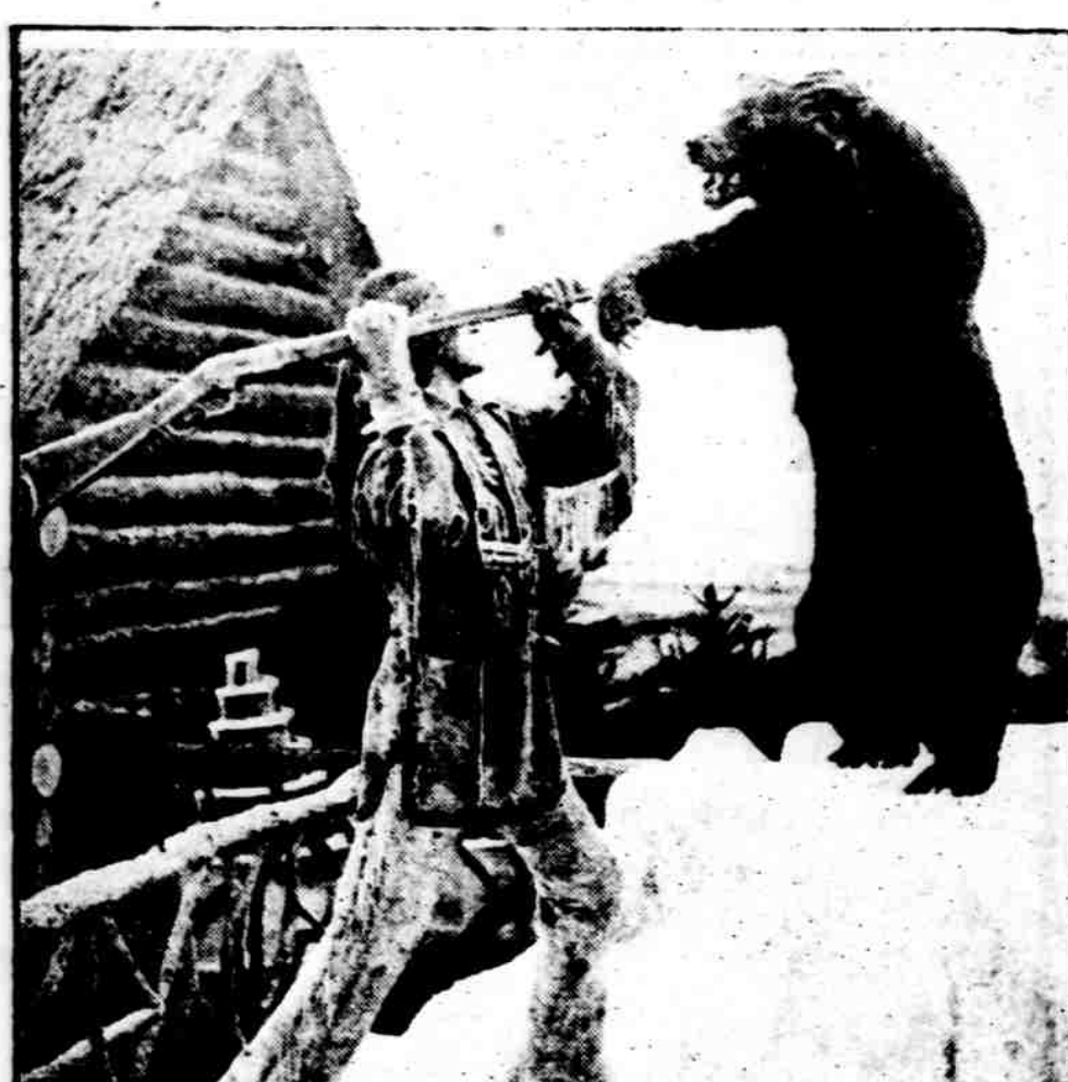
In Palace of Forestry, Fish and Game.

looks into the angry eyes of his addown Chestnut street. "You can tell floor." versary. This is a display of bravery her by the way she glances into the that would go to the heart of any boy. shop windows in which she can see The most realistic of all the exhibits her reflection.