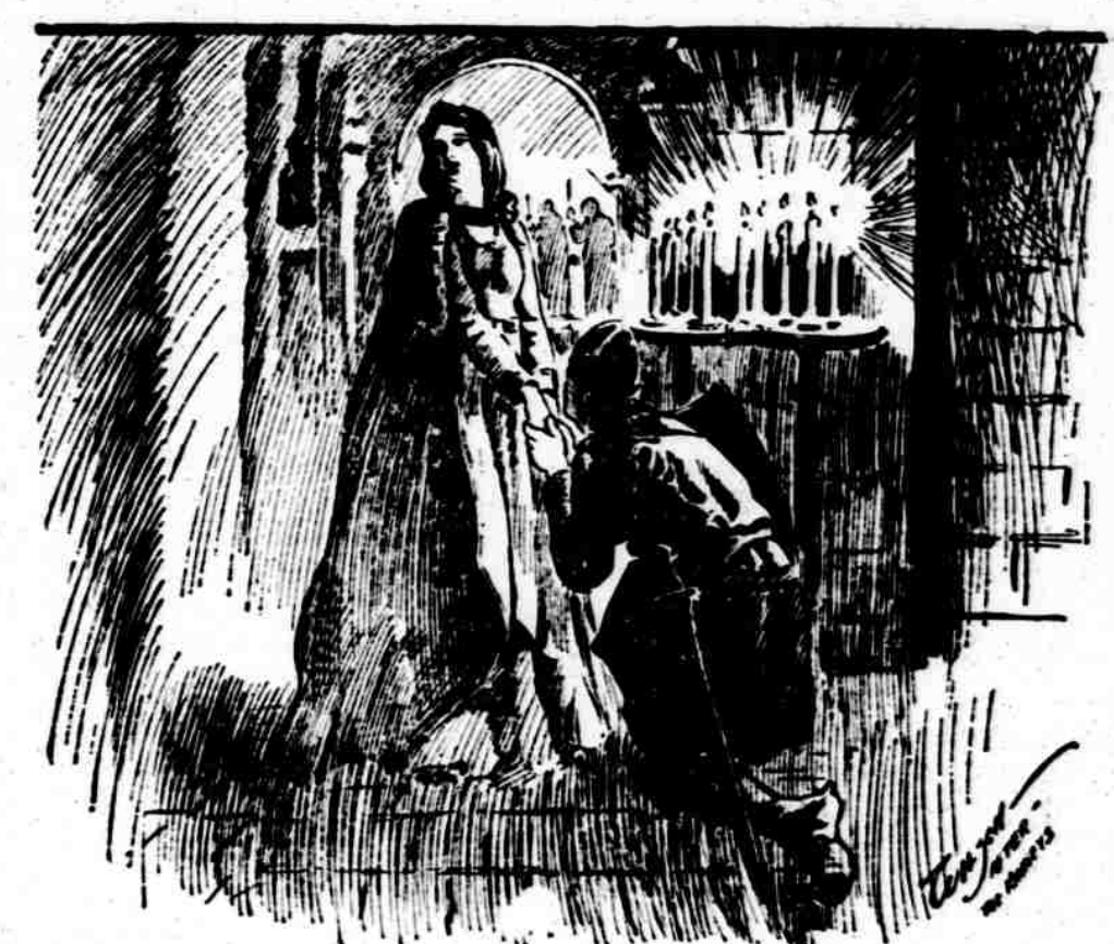
"Is it thus, on his knee, that one offers pity?"

"You will not see him, lady? Not rilgrim as the wanderer shuffled past, "Heaven's mercy!" Elfgiva shrug-