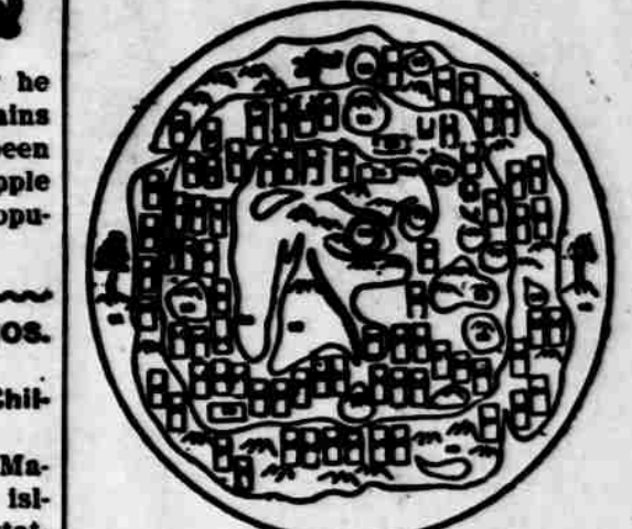
(Map of Philippine Islands, showing location of Malabang marked by star.)

Empire of "The Great Man." Korean school children, when placed side by side with Chinese and Japanese pupils, have always shown themselves to be, from an intellectual point of view, superior.