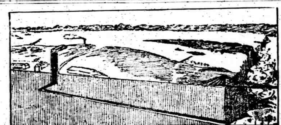
BIRD'S-EYE VIEW AND SECTION OF THE NIAGARA INSTALLATION.

to transport power from the place where it is developed to the points of drunkards going to bed to "sleep off from the Yalu Fight." The following where it is wanted. For a while re- a spree" only to wake to find themselves is an extract from his article: sort was had to long steel ropes. This enveloped in alcoholic flames, the result | It appears from Commander McGifof spontaneous firing of the gases in fin's narrative that both Chinese and posed that the subdued, harnessed and their tissues. Such cases have always Japanese were led, by design or acciwas the way it was for a time suputilized power at Niagara would have ended in an agonizing death. The Brit- dent, to accumulate projectiles and amish Annual Register of 1789 records the munition on deck in advance of imto be communicated to more or less distant points, possibly even as far death by spontaneous combustion of mediate demands-a practice greatly the Countess Bandi of Cesna, Italy. In deprecated. But is the deprecation our country such casese have been rare, wholly sound? Offense is better than One of the most consequential ... of indeed, the last occurring in San Fran- defense. Rapid fire with some risk is cisco in 1877, when a drunkard who was better than slower fire with no risklighting a cigar at a gas jet actually risk, that is, from this particular lighted his breath and died in a few source-because the slower fire yields moments in great agony.