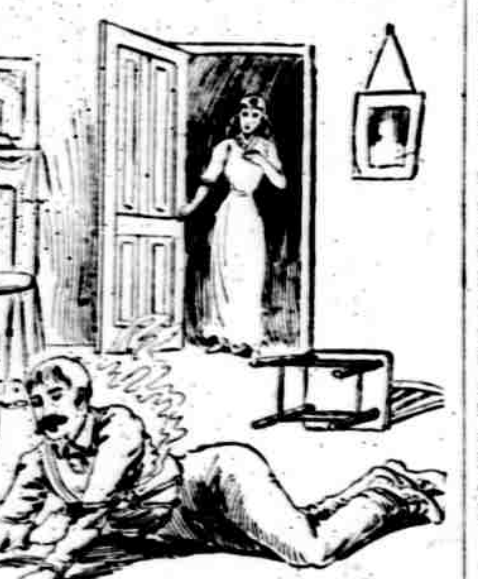
FOUND HIM LYING ON THE FLOOR.