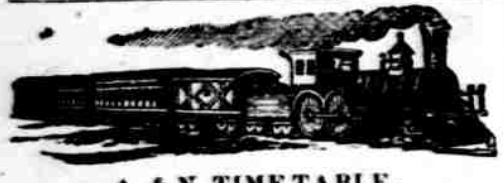
A. & N. TIME TABLE.

Pass. Freight. Leaves Columbus, 8:10 a. m., 1:50 p. m.